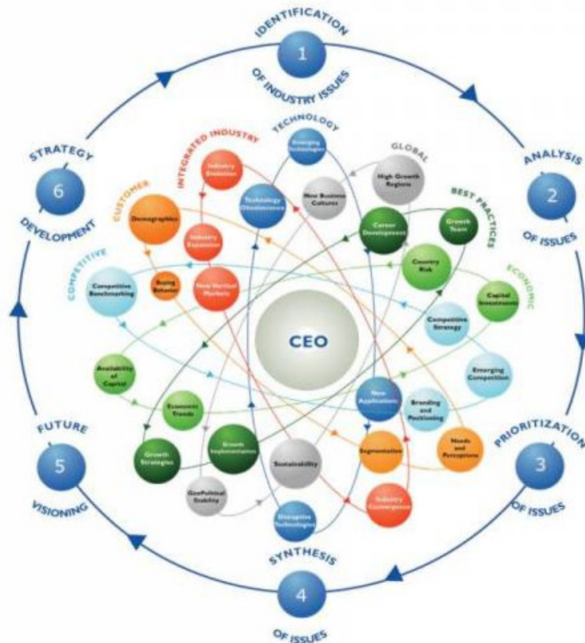
Chart 5: How the CEO's 360-Degree Perspective™ Model Directs Our Research

The CEO 360-Degree Perspective™ model enables our clients to gain a comprehensive, action-oriented understanding of market evolution and its implications for their companies' growth strategies. As illustrated in Chart 5 below, the following six-step process outlines how our researchers and consultants embed the CEO 360-Degree Perspective™ into their analyses and recommendations.