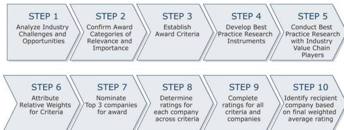
Chart 3: Frost & Sullivan’s 10-Step Process for Identifying Award Recipients