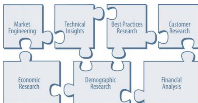
Chart 6: Benchmarking Performance with TEAM Research

Frost & Sullivan's TEAM Research methodology represents the analytical rigor of our research process. It offers a 360-degree view of industry challenges, trends, and issues by integrating all seven of Frost & Sullivan's research methodologies. Our experience has shown over the years that companies too often make important growth decisions based on a narrow understanding of their environment, leading to errors of both omission and commission. Frost & Sullivan contends that successful growth strategies are founded on a thorough understanding of market, technical, economic, financial, customer, best practices, and demographic analyses. In that vein, the letters T, E, A and M reflect our core technical, economic, applied (financial and best practices) and market analyses. The integration of these research disciplines into the TEAM Research methodology provides an evaluation platform for benchmarking industry players and for creating high-potential growth strategies for our clients.